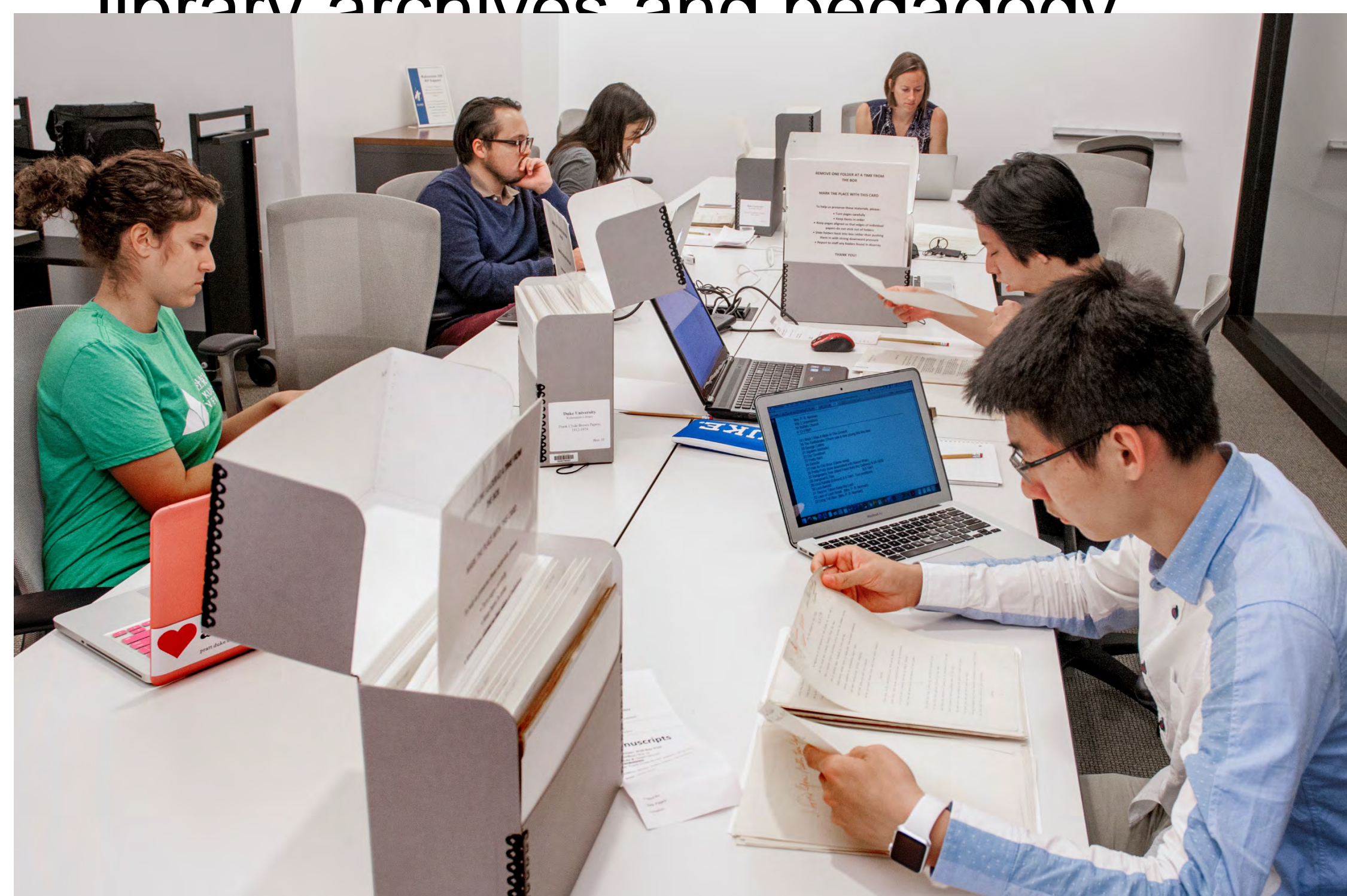
Researching with primary source materials.