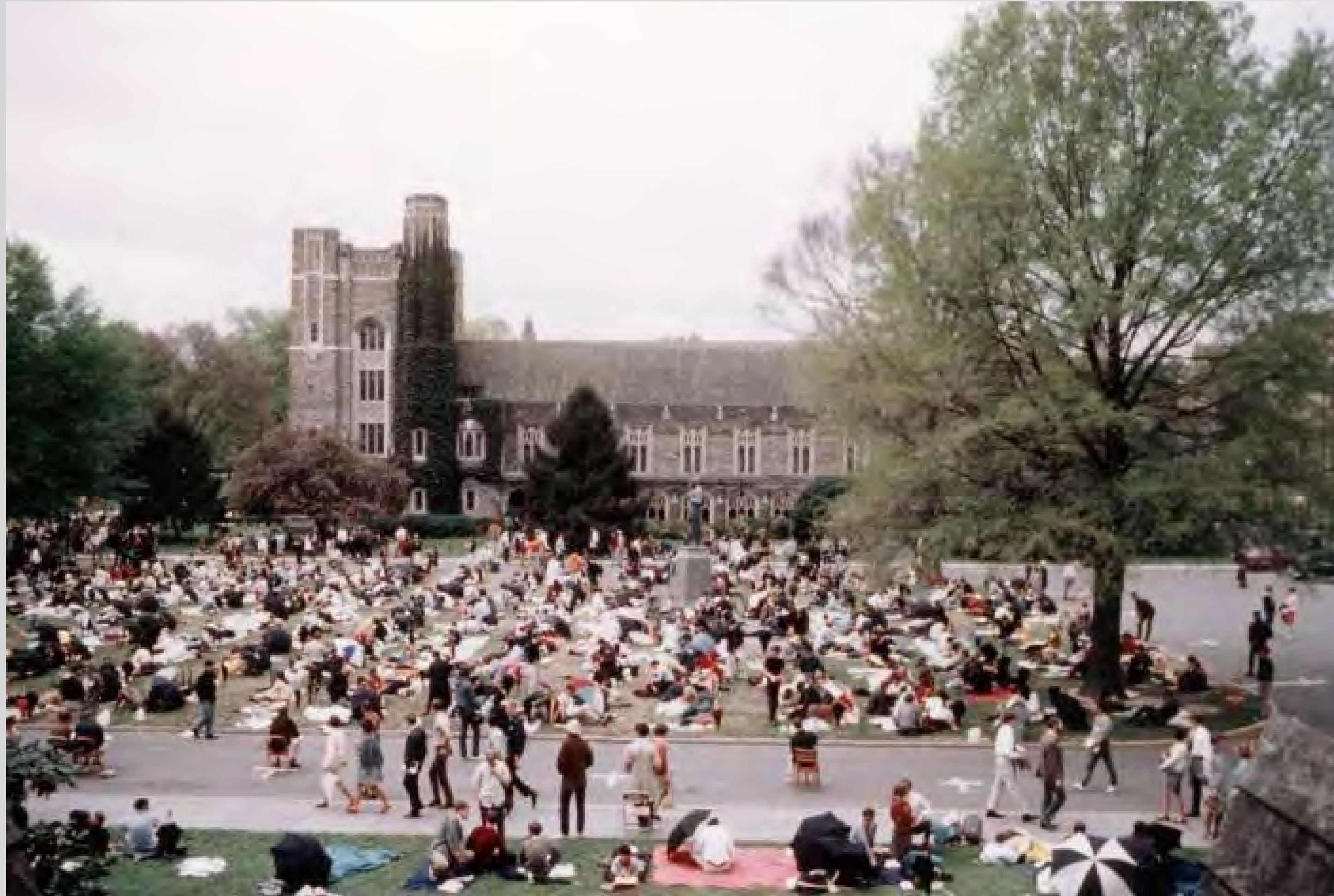
Silent Vigil, 1968