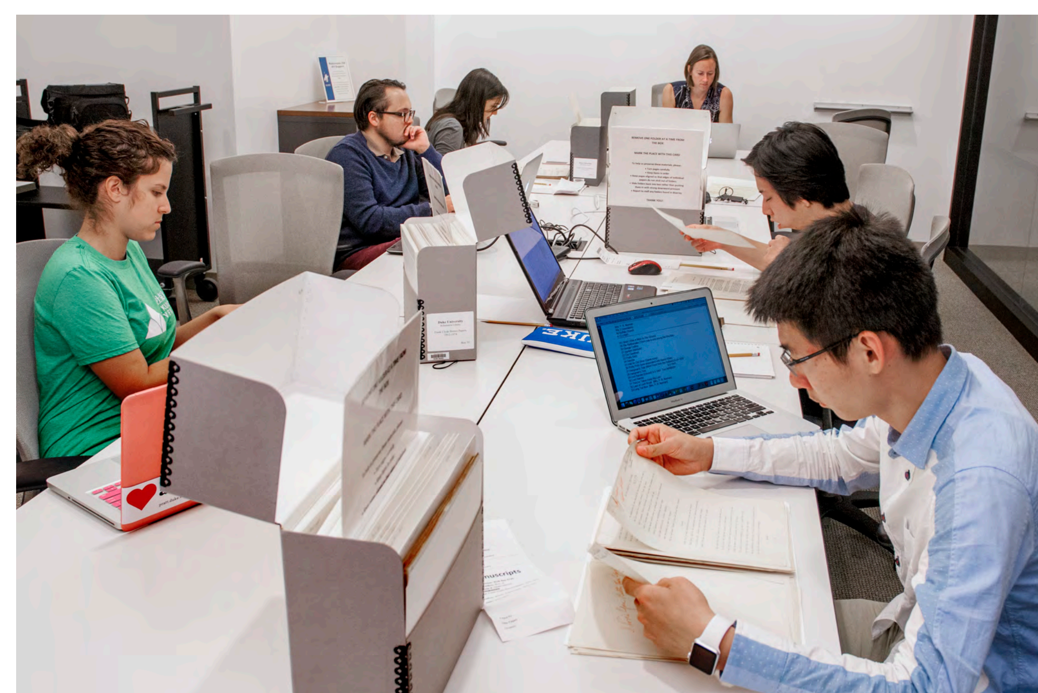
Researching with primary source materials.