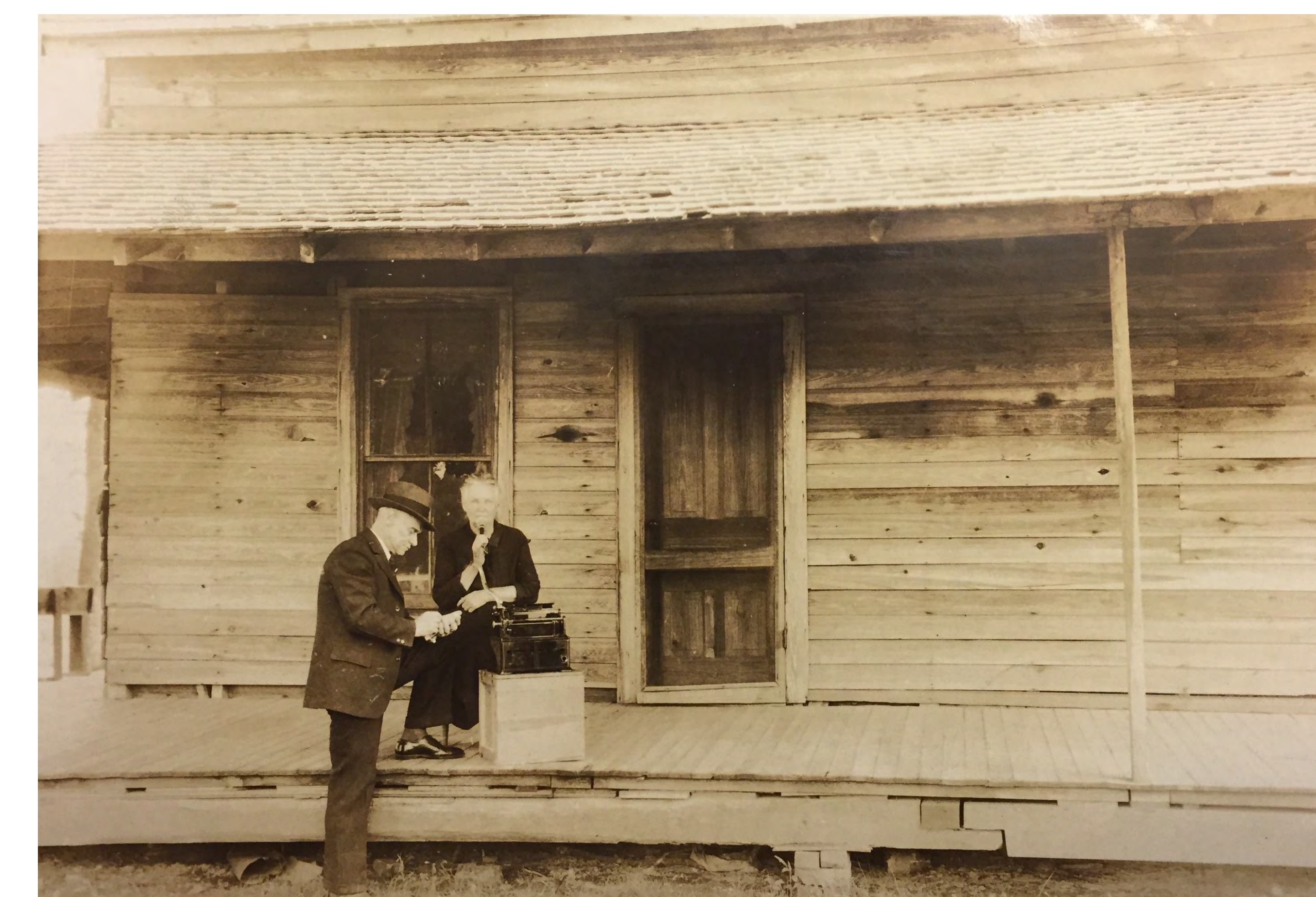
FCB Records a Singer